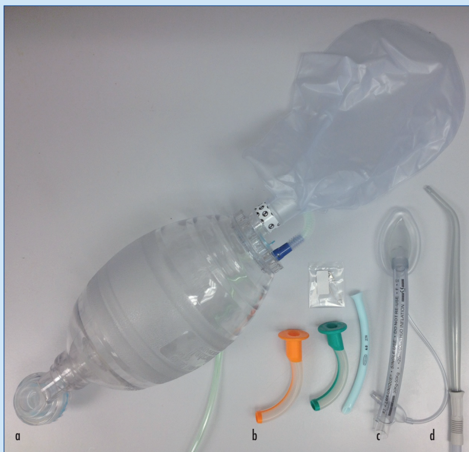
Figure 2. Adjuncts for supporting airway and laryngeal mask. a. Bag-valve-mask system with high flow oxygen source. b. Oropharyngeal and nasopharyngeal airways. c. Laryngeal mask. d. Wide-bore rigid sucker.

A secure airway is one in which the trachea and bronchial tree are protected from aspiration of gastric contents or secretions by the presence of a cuffed endotracheal tube (or a tracheostomy). This is the gold standard for an unconscious patient at risk of aspiration, but should only be attempted by those trained and familiar with the technique of tracheal intubation. This will