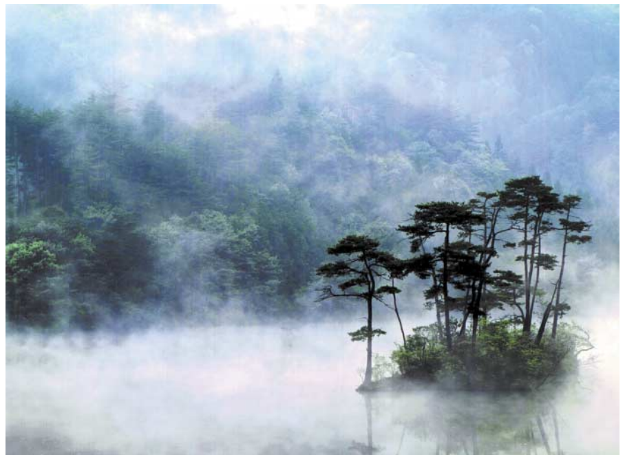
The mist rises: protecting biodiversity means raising awareness about the issue among policy-makers.

The volume is well written, and there is little with which to disagree. The coverage is reasonably comprehensive and remarkably up to date, with many of the sources cited having been published in the past 18 months. The first two-thirds of this book comprises chapters addressing, in some detail, the nature and origins of biodiversity, its dynamics and distribution, and its relationship to humans both now and in the future. These pages are stuffed full of striking photographs, tables, graphs and maps. The value of some of these is perhaps a little