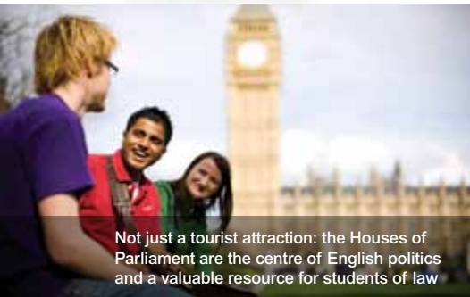
Not just a tourist attraction: the Houses of Parliament are the centre of English politics and a valuable resource for students of law