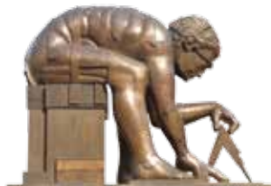
Sir Isaac Newton statue in the nearby British Library courtyard, by UCL alumnus Eduardo Paolozzi

// Biological Sciences students have easy access to ZSL London Zoo, the Natural History Museum or the Royal Botanical Gardens at Kew