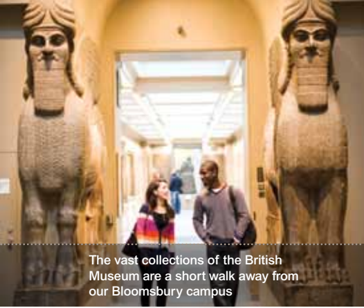
The vast collections of the British Museum are a short walk away from our Bloomsbury campus