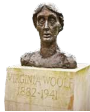
Writers such as Virginia Woolf (pictured) and E.M. Forster, artists such as Roger Fry and Vanessa Bell and the economist John Maynard Keynes, all lived and worked in Bloomsbury in the early twentieth century

From learning to literature, art to architecture, science to sport, history to pop culture and enterprise to governance, London has it all. As Samuel Johnson succinctly put it, "When a man is tired of London, he is tired of life; for there is in London all that life can afford."