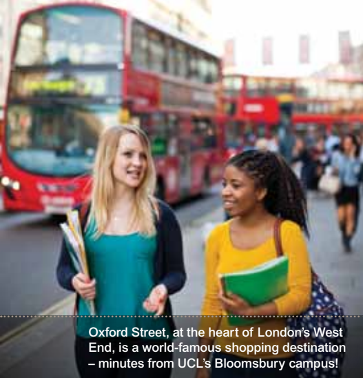
Oxford Street, at the heart of London's West End, is a world-famous shopping destination – minutes from UCL's Bloomsbury campus!