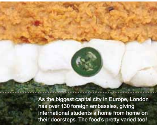
As the biggest capital city in Europe, London has over 130 foreign embassies, giving international students a home from home on their doorsteps. The food's pretty varied too!