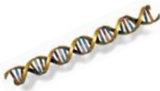
Francis Crick (Physics 1937) won a Nobel Prize for his part in the discovery of the double helix structure of DNA

Virtual networkers can join our LinkedIn Alumni Group, which currently has over 2,000 members.