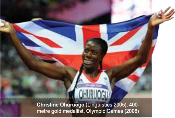
Christine Ohuruogo (Linguistics 2005), 400-metre gold medallist, Olympic Games (2008)