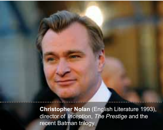
Christopher Nolan (English Literature 1993), director of Inception , The Prestige and the recent Batman trilogy