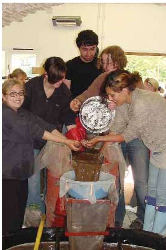
Sieving for environmental remains at West Dean

Students have full reading and borrowing rights in all UCL Library Services facilities, and can make use of the web-based catalogue, networked databases and other electronic resources. The institute's library offers specialist help and support to all students. It is also possible to borrow from the Senate House Library of the University of London, the School of Oriental and African Studies Library and gain access rights to a number of other academic libraries within the London area.