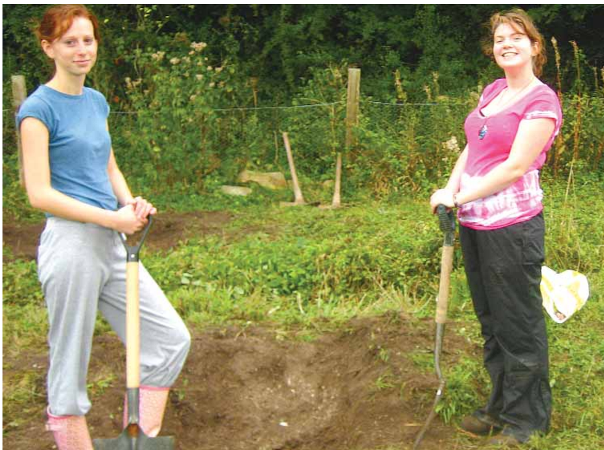
First-year students on the Experimental Archaeology course

The institute offers around 50 undergraduate places each year, for which there are usually around 250 applications. Applicants being considered for the offer of a place are normally required to attend an Open Day and interview unless based overseas. The interviews are informal and conversational. Following the interview, the Admissions Tutor will make recommendations to the Faculty about whether or not a place should be offered. The Institute of Archaeology holds several Open Days between November and March. These provide the opportunity to ask questions of the