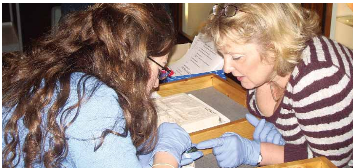
Examining Egyptian artefacts at the Petrie Museum

The Centre for Applied Archaeology (formerly the Field Archaeology Unit) was established in 1974 as a self-funding research, rescue and teaching division of the Institute of Archaeology. Today the centre, through its commercial division, Archaeology South-East, operates throughout