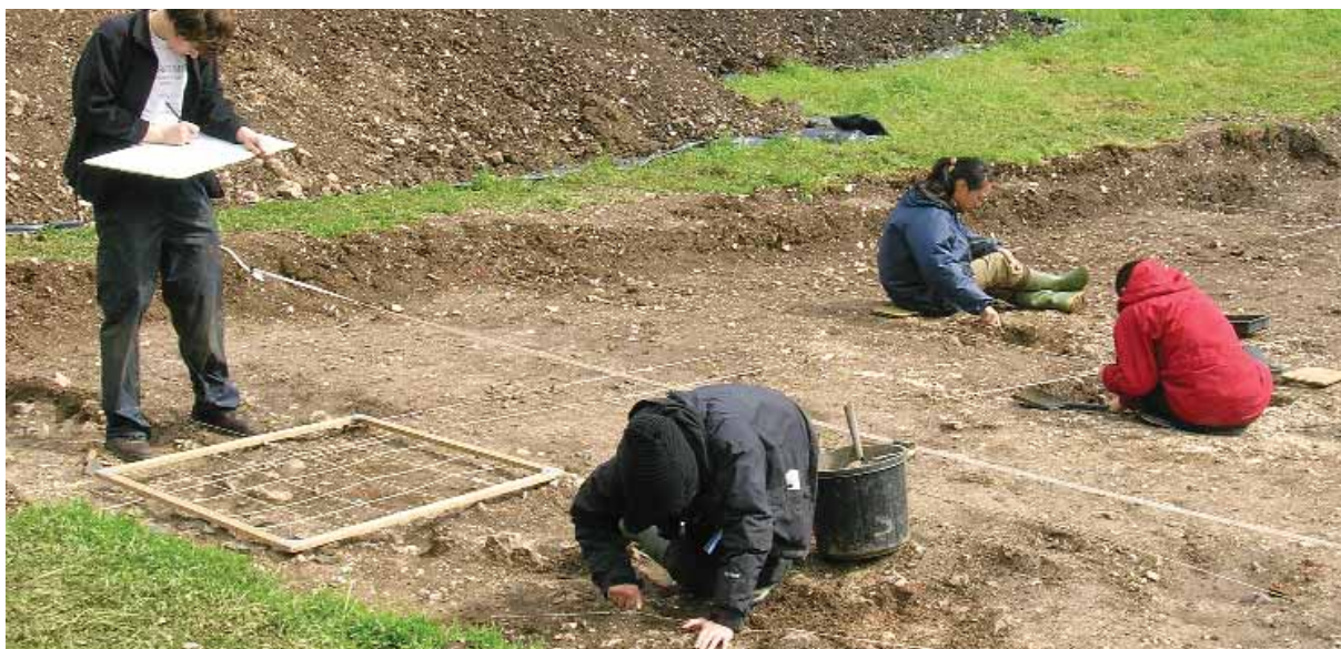
Excavations at Batten Hanger Roman Villa, West Sussex

All students registered for this degree are required to undertake a six-week study visit to the Mediterranean as part of their 70 days of fieldwork.