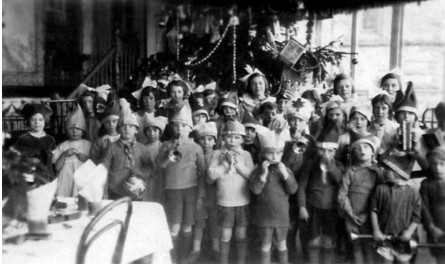
Children at a Christmas party in the Adelina Patti Theatre, 1928.