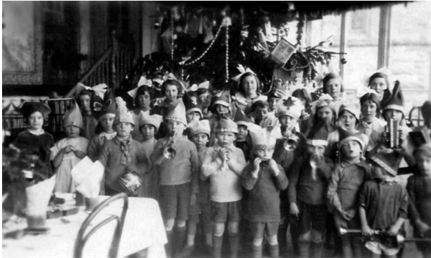
Children at a Christmas party in the Adelina Patti Theatre, 1928.