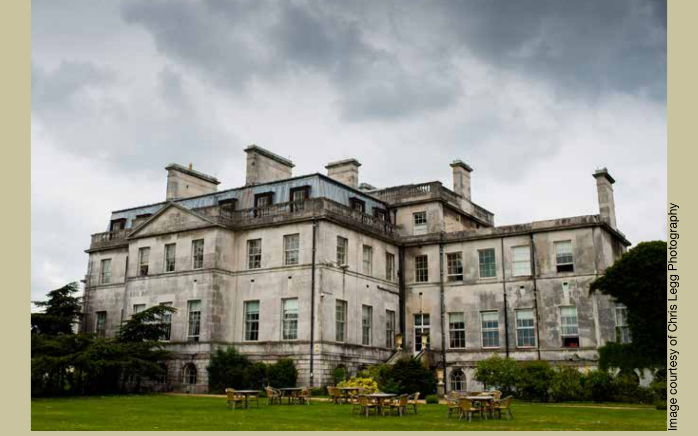
Addington Palace, home of several generations of slave-owning families.