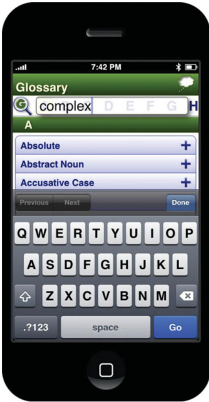
Figure 4. Searching the glossary

and over again with the same examples, as is the case with printed textbooks. The App allows users' highest scores and fastest times to be recorded for every exercise, and these scores can be reviewed in the 'Exercise overview' (available