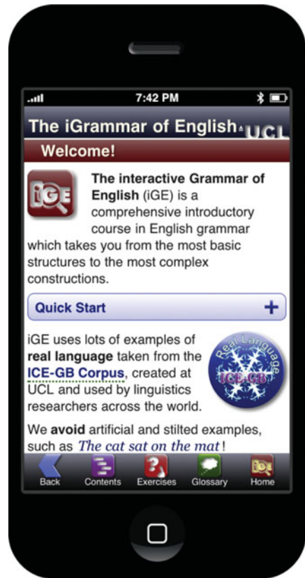
Figure 1. iGE Welcome screen (iPhone)

About half-way down the screen is a ‘Quick Start’ menu bar (Figure 1) which expands when tapped to offer a ‘Start the course’ option and other tools listed at the bottom of the screen (‘Back’, ‘Contents’, ‘Exercises’, ‘Glossary’ and