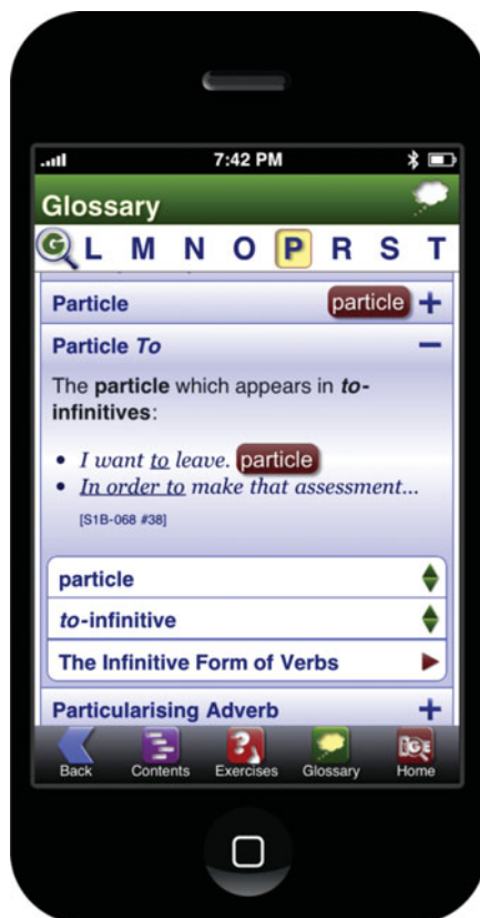
Figure 3. A glossary entry

similar visual highlighting device: a rectangle with a white outline, visible here as a shading around the rectangles: Subject Predicate . Students are taught a series of novel concepts in rapid succession, and we have found that visual cues like this can be a useful aide-mémoire .